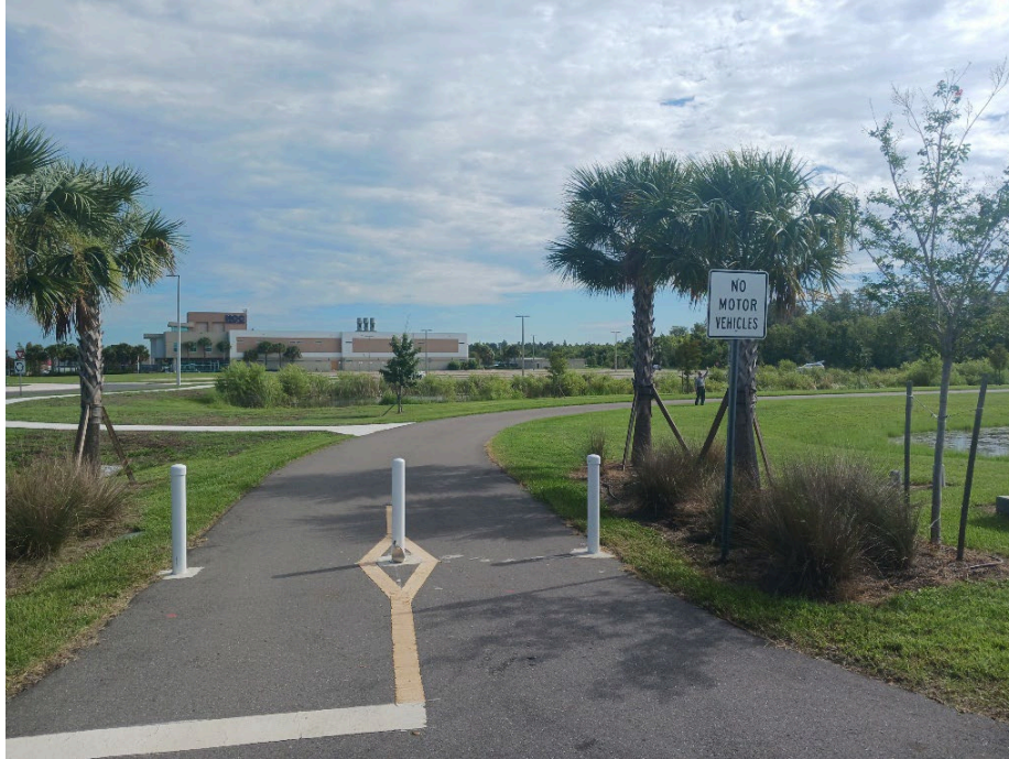
Photo from the trail entrance at Shell Point Road. Relational Figure (person standing) is at the art location, as seen between the palm trunks on the right of the photo. A sculpture at this location surrounds the viewer in the trail environment. In the distance is an HCC campus building.