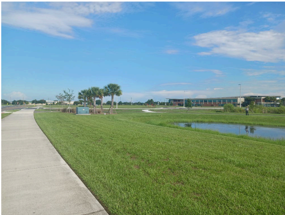
Photo from the sidewalk along Shell Point Road. Relational Figure (person standing) is at the art location, as seen far on the right of the photo.